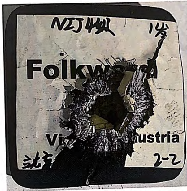
Fig. 1 Bulletproof Plate-ECO IV Sideplate 15×15 (strike face)